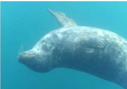
Showing us who is the most at home in the water