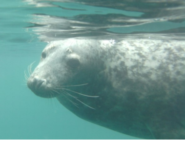
Showing us who is the most at home in the water