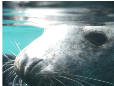
Trying to avoid eye to eye contact...